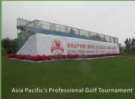
Asia Pacific's Professional Golf Tournament