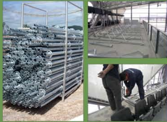
Professional Installation and Maintenance team On-site modular assembly All-weather work.