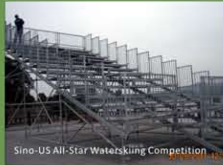
Sino-US All-Star Waterskiing Competition