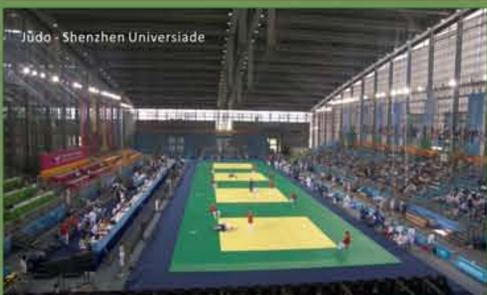
Judo - Shenzhen Universiade