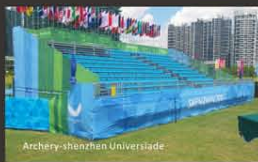
Archery - Shenzhen Universiade