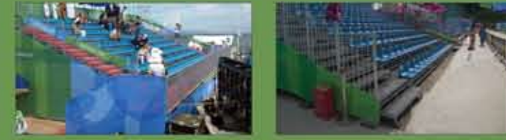
1st row elevated Non-elevation