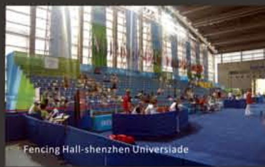
Fencing Hall - Shenzhen Universiade