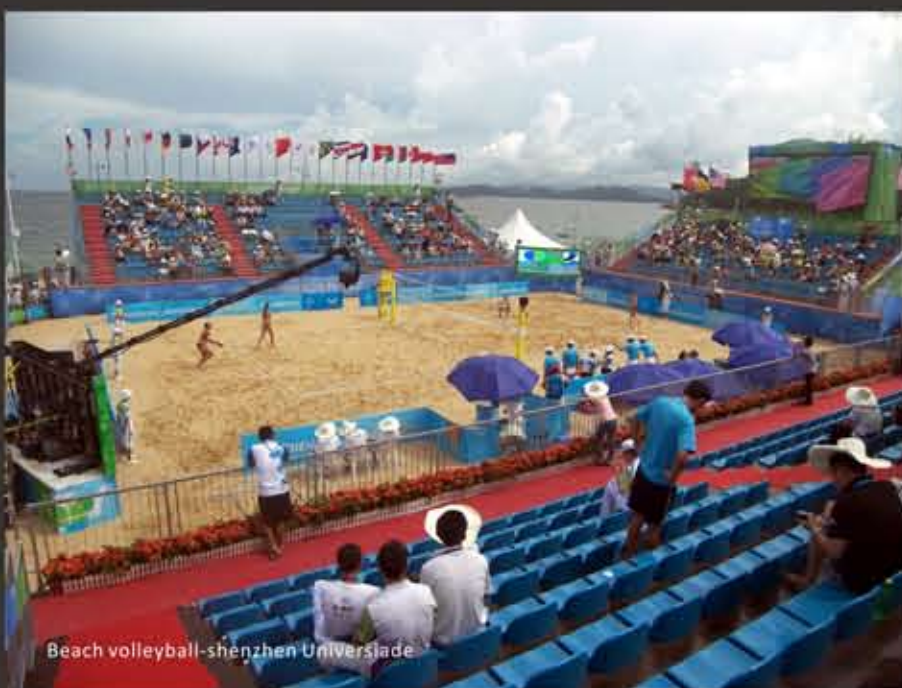
Beach volleyball - Shenzhen Universiade