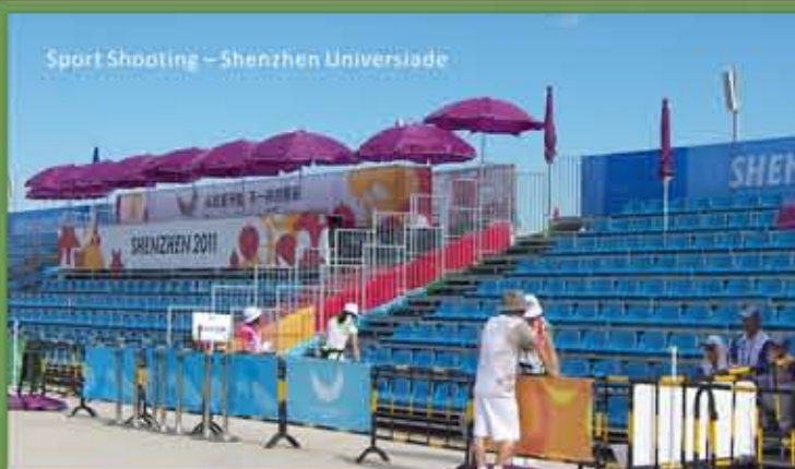
Sport Shooting - Shenzhen Universiade