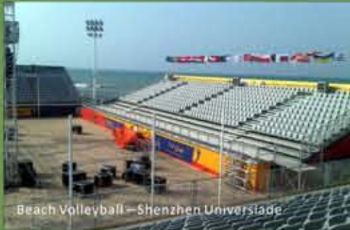
Beach Volleyball - Shenzhen Universiade