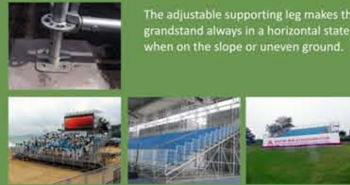
Sandy land Concrete floor Grassland