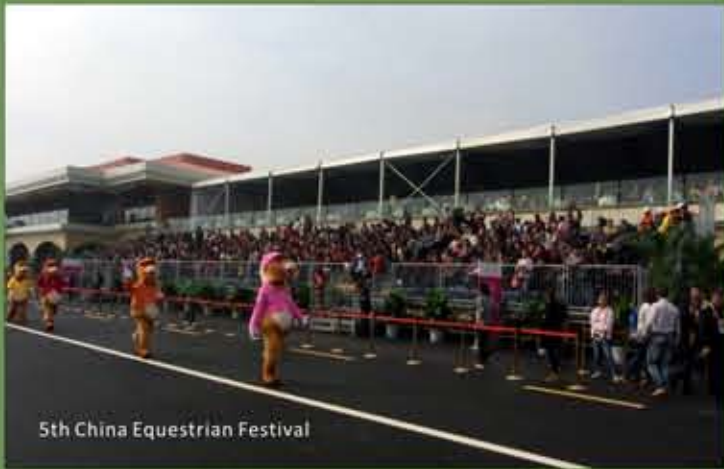
5th China Equestrian Festival