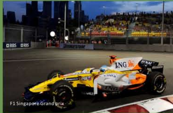
F1 Singapore Grand Prix