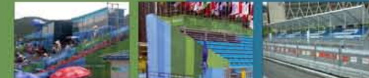
Control Room Camera-bit platforms Shaded shed

Aneasy Metal Structural Bleacher Seating System can configure functional modules according to the on-site requirements, in addition to meet the basic needs of the spectators.